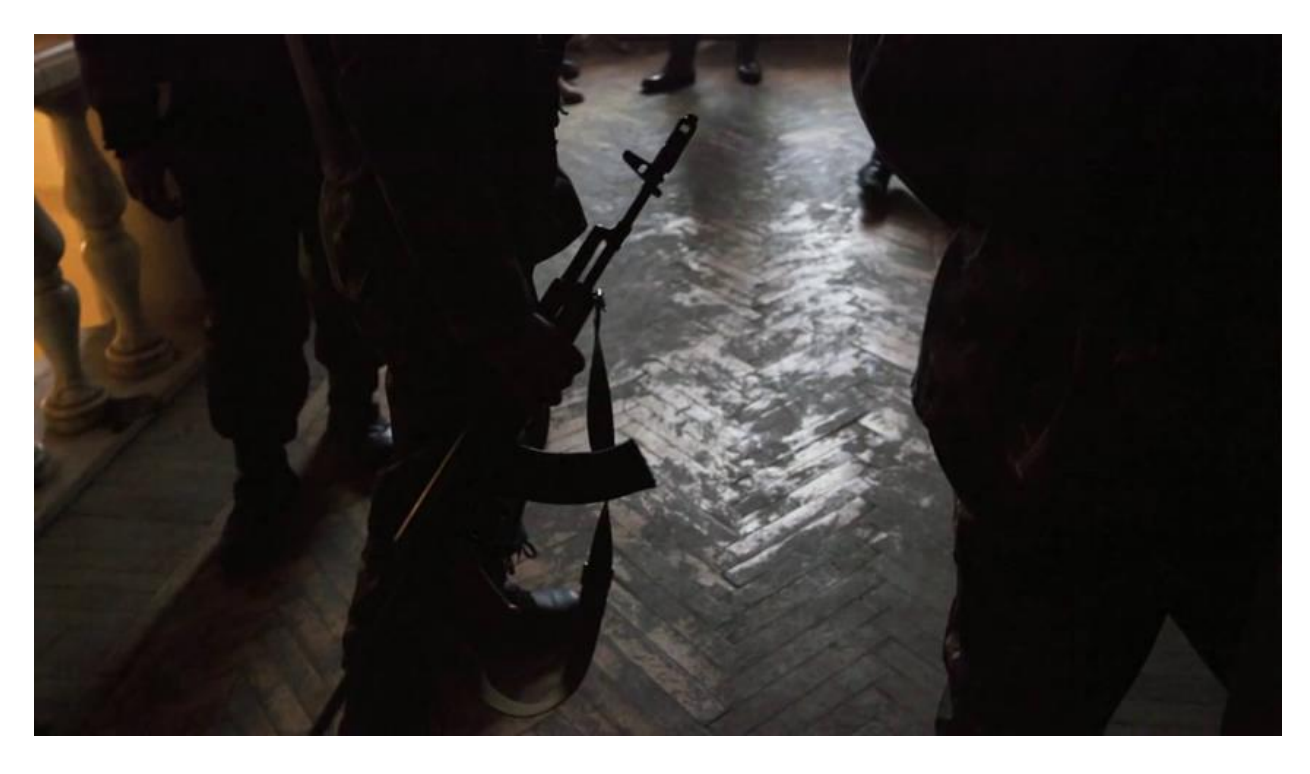
Photo 1. A Maidan shooter armed with a Kalashnikov assault rifle inside the Music Conservatory shortly after 8:00am around the time of mass shooting of the Berkut from this building.

morning before 9:00 am, as well as Berkut throwing Molotov cocktails at the second floor of the conservatory where the shooters were based. A STB news report briefly shows an apparent shooter there around 8:00am. <sup>45</sup> The BBC investigation includes photos showing Maidan shooters armed with hunting rifles and a Kalashnikov assault rifle inside the Music Conservatory shortly after 8:00am. (See Photo 1 and 2). Videos show several members of these police units carried out and put into ambulances some time before 9:00am on February 20. <sup>46</sup> An Interior Troops officer reports being injured by pellets in the Maidan area after 8:00am. In their radio communications, the Internal Troops units, stationed at Maidan near the Trade Union building, made urgent requests for an ambulance at 8:08am, a life support vehicle at 8:21am, an ambulance at 8:29am, two ambulances at 8:39am and five ambulances at 8:46am, before issuing retreat orders at 8:49 and 8:50am. <sup>47</sup>