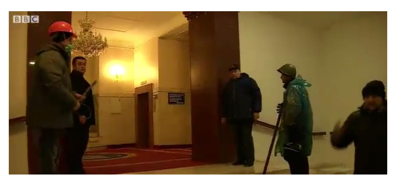
Photo 8. The leader of the Khmelnytsky regional organization of Svoboda party and Maidan protesters guard the entrance to the stairways and the elevators in the Hotel Ukraine during the massacre of the protesters by shooters from this hotel circa 9:51am (Source: "Бои в Киеве: снайперы, раненые и автоматные гильзы," BBC Russian , February 20, 2014, http://www.bbc.co.uk/russian/multimedia/2014/02/140220_kiev_maidan_wounded_bbc).

It would have been irrational for the Maidan leaders not to act on such information and deploy the armed Maidan groups to locate and detain or kill these snipers, who continued to massacre the Maidan protesters for a relatively long time period. This specifically concerns Parubii and Yarosh, who stated that they were during the massacre on the Maidan. But such actions become rational if these snipers were not from the government side or "third side" but from the Maidan side conducting a false flag operation. Such false flag operation to succeed in mass killing of the protestors required that it was conducted in secret not only from the government of Ukraine and its forces but also from journalists and the Maidan protesters, including many leading Maidan activists and many Maidan Self-Defense members and commanders with the exception of small minority, that included snipers, spotters, and their security. Specifically Parubii and Yarosh stated in media interviews that they were present during the massacre on the Maidan, but there is not a single publicly available video or photo showing their specific whereabouts and actions at the time of this mass killing. This is another dog that did not bark evidence indicating that the Maidan massacre was a false flag operation by a section of the Maidan leaders and a very small faction of the protesters.